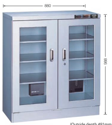
WET-302-AHU (Inside depth 390mm)