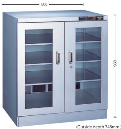
WET-512-AHU (Inside depth 650mm)