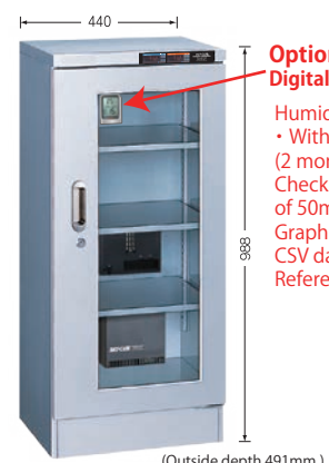
WET-162-AHU (Inside depth 390mm)

Optional mounting example Digital hygrometer