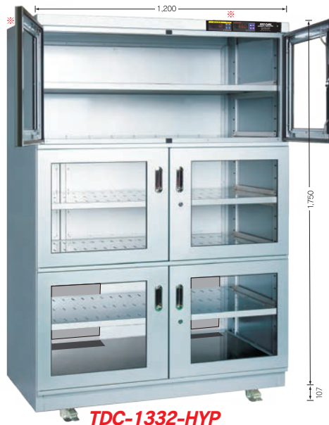
TDC-1332-HYP TDC-1332-DUS (Depth inside 650mm)