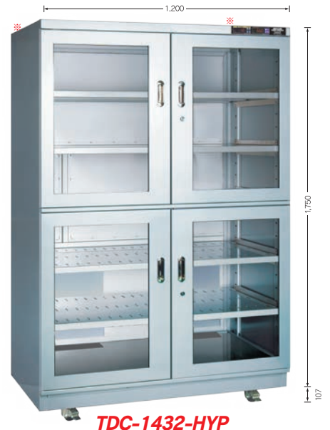
TDC-1432-HYP TDC-1432-DUS (Depth inside 650mm)

SPECIFICATION ※Specifications are subject to change without notice. ● Dimensions: Displayed in the order of W (width) x D (depth) x H (height)