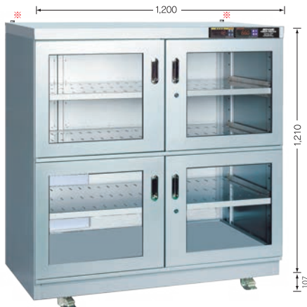
TDC-932-HYP (Depth inside 650mm)

※Earthquake countermeasures : Bolts and nuts for attaching fall prevention metal fittings are installed on the top plate. (2 places). (Fall prevention metal fittings are optional)