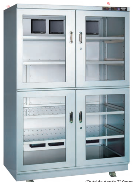
TDC-1432-PDX (Inner Depth 650mm)