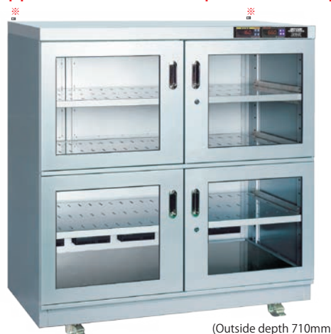
TDC-932-PDX (Inner Depth 650mm)

Low humidity operation ( \pm 5\% RH) is possible by setting the humidity. By suppressing the lowering of humidity more than necessary, waste of power consumption can be suppressed.