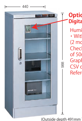
WET-160-AHU (Inside depth 390mm)