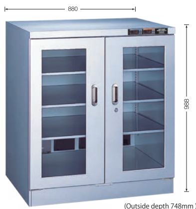
WET-510-AHU (Inside depth 650mm)