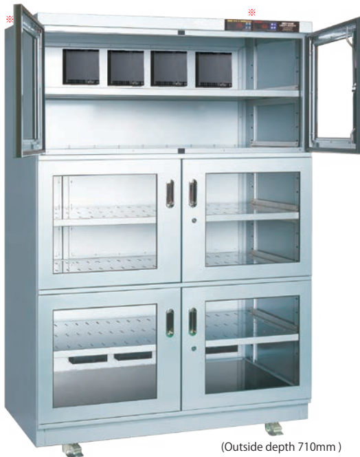
(Outside depth 710mm) TDC-1330-PDX (Inner Depth 650mm)