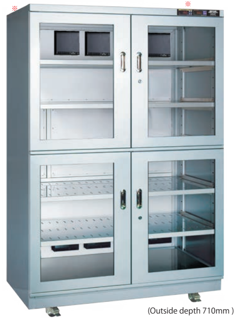
(Outside depth 710mm) TDC-1430-PDX (Inner Depth 650mm)