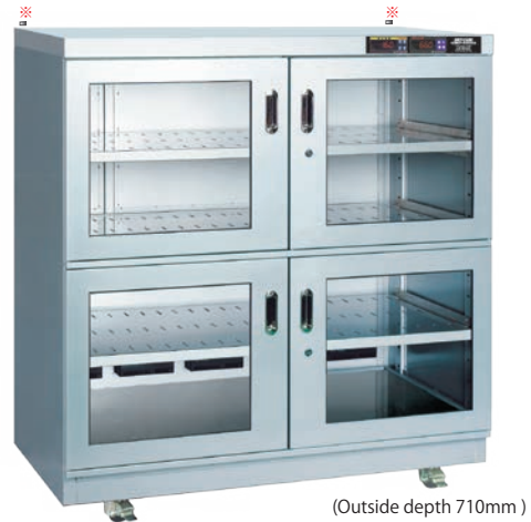
(Outside depth 710mm) TDC-930-PDX (Inner Depth 650mm)

※ Anti-seismic measures: for mounting the anti-falling metal fitting (option) on the top of the top plate Install bolt and nut in 2 places on left and right