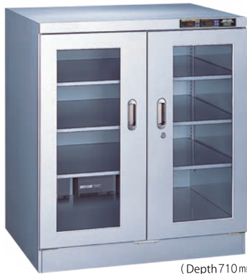
TDC-510-PDX (Inside depth 650mm)