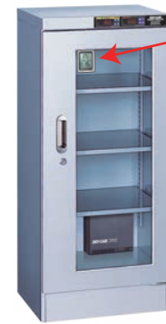
TDC-160-PDX (Inside depth 390mm)

Optional mounting example Digital hygrometer