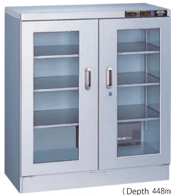
TDC-300-PDX (Inside depth 390mm)